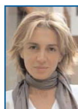
Sahar Hashemi Serial Entrepreneur